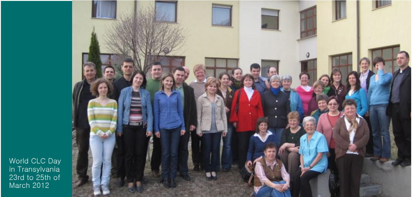
World CLC Day in Transylvania 23rd to 25th of March 2012